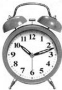
an alarm clock